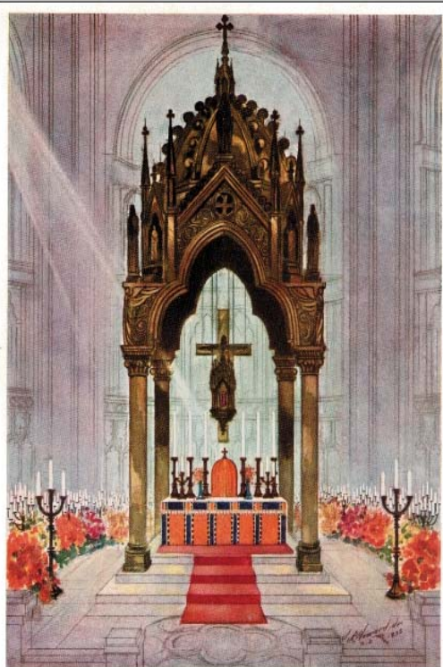
The High Altar of a large church adorned for Pentecost. Only two pairs of flowers are on the Altar, the other flowers being around it. This arrangement is due to the Altar for the production and usual arrangement of Priest and Ministers that would be caused by a multiplicity of candles and vessels. The altar is the frontal and the frontal supports the crucifix of the Blessed Virgin with the Spirit when the Holy Ghost descended. (The Altar is not shown in order to make clear the decorative scheme.)